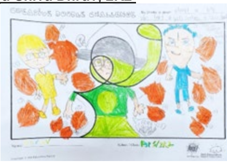
Piduru Shiva Dhruv, 2R2