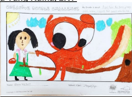
Moana Yang Ruina, 2R1